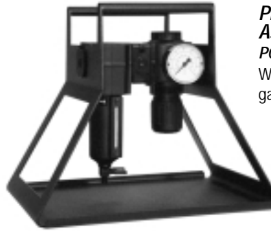
Protective Cage Assembly PC0752 With filter/regulator/pressure gauge